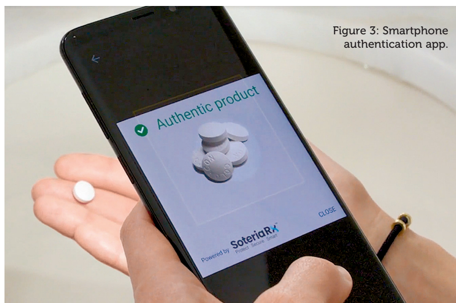
Figure 3: Smartphone authentication app.

“The introduction of a smartphone app means that patients can play a part in verifying their medication, and that interaction could be leveraged to add value through patient engagement and brand loyalty.”